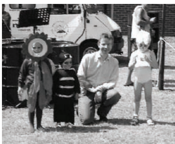
Michael Gove - MP with fancy dress winners

Also in the central arena was the Children's Fancy Dress Competition that was judged by Michael Gove the new Member of Parliament for Surrey Heath.