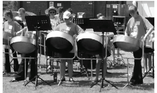
Connaught School - Steel Band

The Radio Frimley Park Hospital Team compered the main festivities, and the D.J. s, with their humour and imaginative choice of music, did a brilliant job, of getting people to join in with the swing of things.