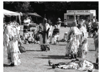
Playmakers Mummies Play

There were numerous stallholders who represented various groups from in and around the village. They were there to either raise money for charity, or to promote and raise awareness of their particular activities. The feedback confirms they had a great day.