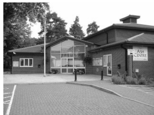
The Entrance to Ash Centre

The fully air-conditioned building offers modern and adaptable accommodation, for commercial, social and sporting activities. The building has also been awarded the Mayor of Guildford's Award for Easy Access for the disabled.