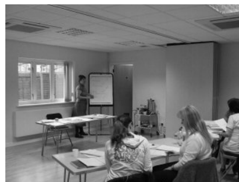
Meeting Rooms 1 and 2

The meeting rooms offer flexible accommodation and can be hired individually. They are ideal for group meetings, syndicate work or as an interview venue.