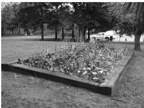
The new flowerbed at Coronation Gardens

Our dedicated Ground Staff, under the direction of Head Groundsman Mark Collings, have been hard at work landscaping the roundabout at Lakeside Road and have completed the flowerbed in Coronation Gardens.